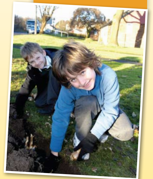
Youngsters plant bulbs in Eccleston.