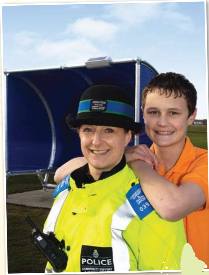
The launch of the Shelter was a community event.