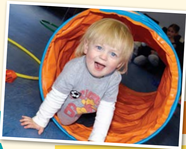
Youngsters enjoy the many activities on offer at Moss Bank, Billinge and Rainford Children's Centres.

Secretary of State for Children, Schools and Families, Ed Balls recognised St.Helens success and said: