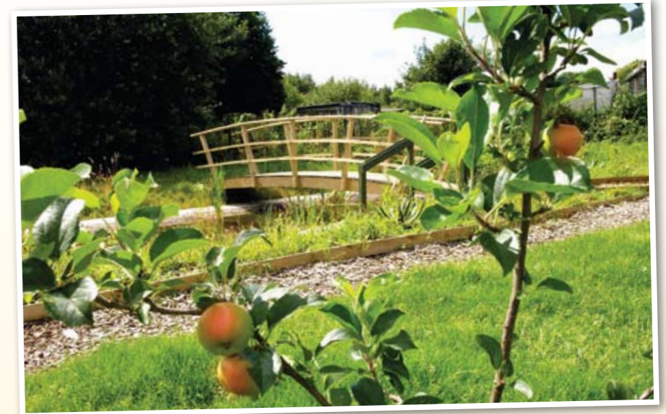
The new Nanny Goat Park Nature Reserve is beginning to bloom.

Rainhill: More public seating areas; Memorial planting in Houghton Street; Home Zone sign for Two Butt Lane, Holt Lane. Work to remove discarded chewing gum on Warrington Road.