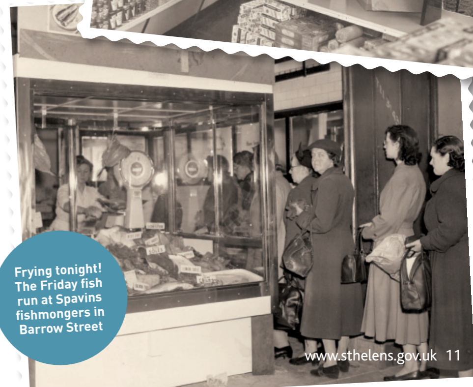
Frying tonight! The Friday fish run at Spavins fishmongers in Barrow Street