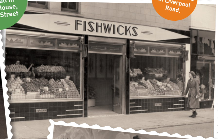
Fishwicks greengrocers in Liverpool Road.