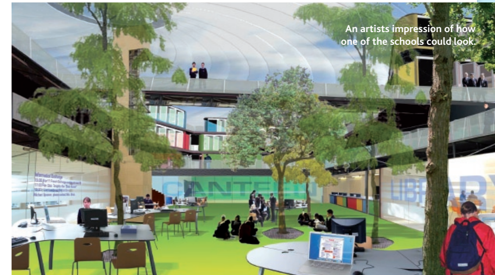
An artists impression of how one of the schools could look.

A proposed new £20-million Catholic Learning Campus for the Community on the site of St Cuthbert's Catholic Community College for Business and Enterprise, to replace St Cuthbert's and St Augustine's to cater for 1350 pupils aged 11 - 16.