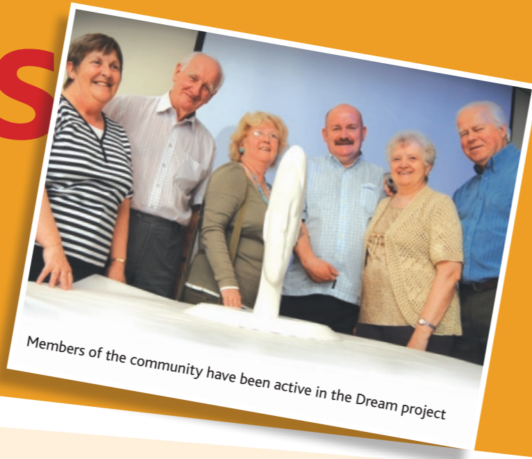
Members of the community have been active in the Dream project

New art works put St. Helens at the cultural hub of the North West as Dream and Antony Gormley's Field head for the town.