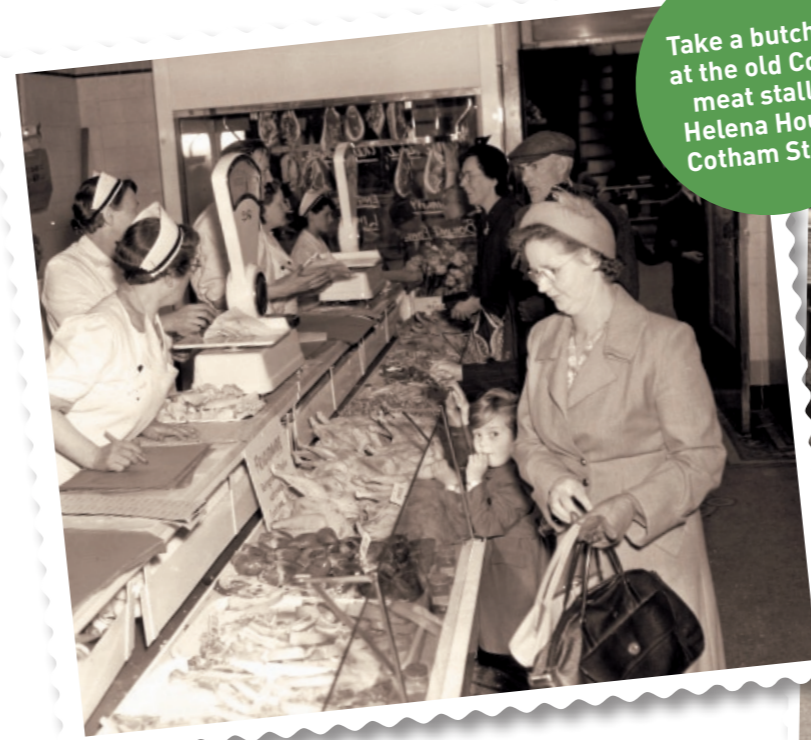
Take a butchers at the old Co-op meat stall in Helena House, Cotham Street