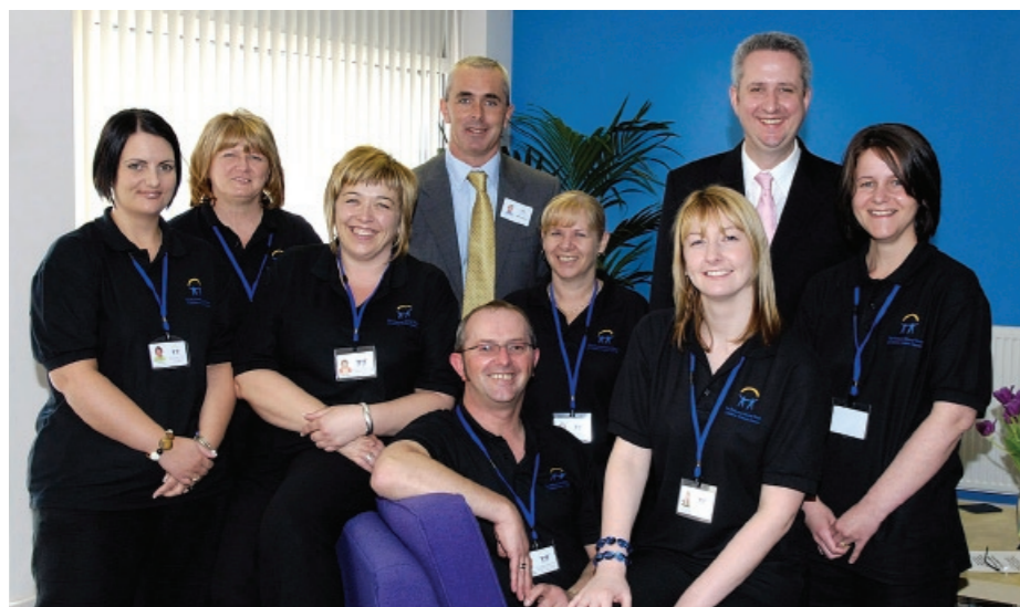
Minister Ivan Lewis (top right) opens the Centre

You can contact St.Helens Carer's Centre on 01744 675615.