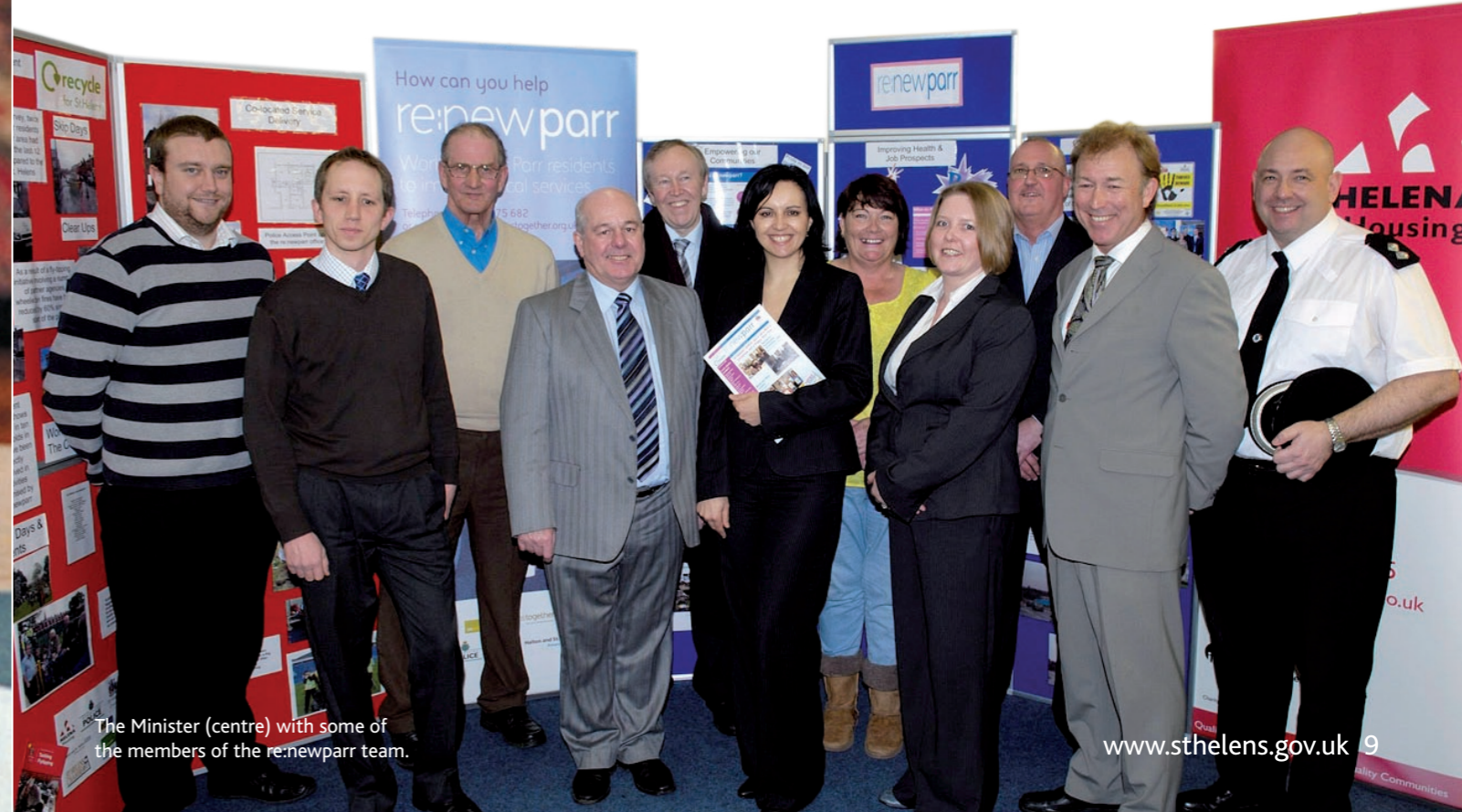
The Minister (centre) with some of the members of the re:newparr team.