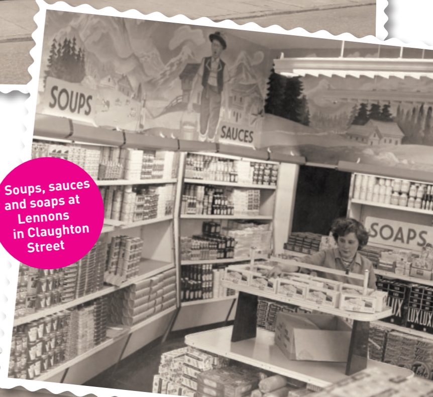
Soups, sauces and soaps at Lennons in Cloughton Street