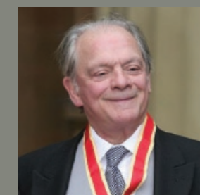
Sir David Jason OBE.

This carer has had help in Dementia Awareness Training and gets support from the local Dementia Support Group and therapies at the Centre.