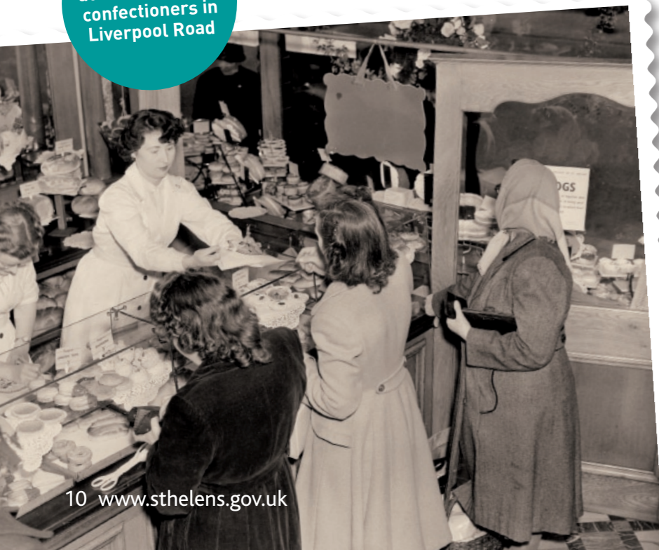
Sweet dreams at the old Sayers confectioners in Liverpool Road